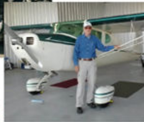
2014: With my fully restored 1947 Cessna 140