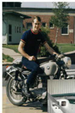
1970: In front of Building I, Bitburg housing area, with the Bitburg BX in the background

Memories Experiencing the cultures of many European countries