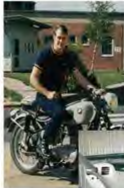
1978: in front of Building 1, Bitburg housing area, with the Bitburg BX in the background

Memories Experiencing the cultures of many European countries