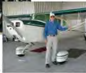
2014: With my fully restored 1947 Cessna 140