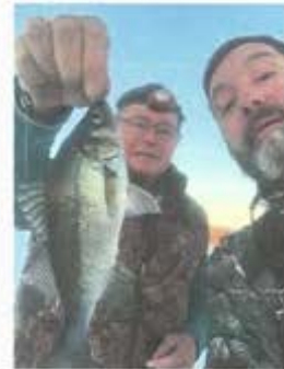
The Veterans on the Ice Fishing Sheds sits over approx. 30 ft of water on Long Lake currently on 14+ inches of ice.