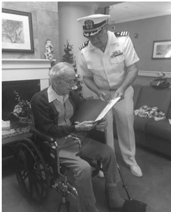
The USVA Togus hospital operates a 12 room hospice and palliative care center, opened in 2011. This end-of-life care wing provides first class care with the utmost respect and dignity for Maine veterans

Complete and file form VA 29-8636 (Application for Veterans' Mortgage Life Insurance).