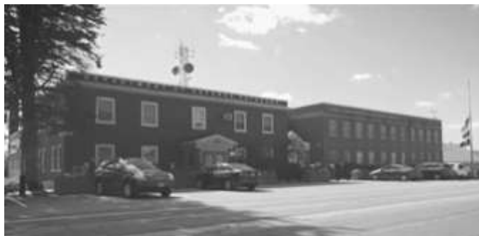
MBVS Office, Augusta, ME