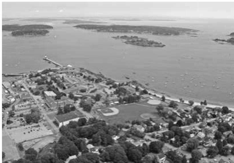
Southern Maine Community College Campus