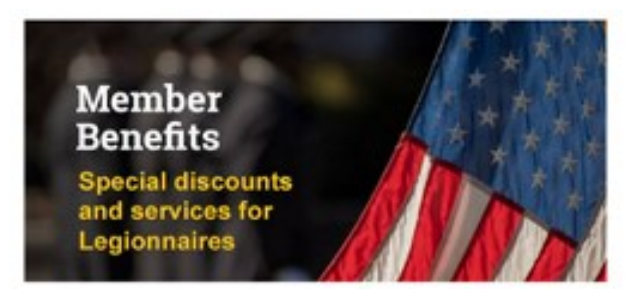
Click HERE for More Information or go to: www.legion.org/benefits