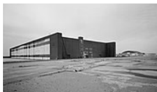
A view of the hangar, looking towards the southeast

A: Located at Loring Air Force Base, Limestone, ME, it was known as “Hangar 8280”. The hangar measured approximately 250 feet (76 m) by 600 feet (180 m) and with appurtenances covered 3.925 acres (1.588 ha).