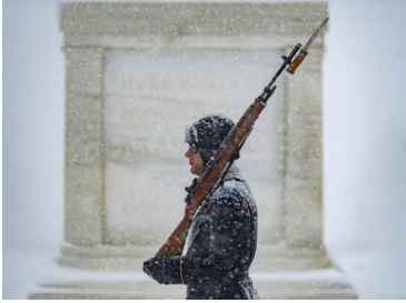
A tomb guard from the 3d U.S. Infantry Regiment (The Old Guard) walks the mat during a snow storm at the Tomb of the Unknown Soldier at Arlington National Cemetery, Arlington, Va., Jan. 3, 2022.

Monday morning saw the Washington, D.C. area receiving a rare blanketing of snow, ranging from 5 to 10 inches in some locations. For the sentinels who stand guard at the Tomb of the Unknown Soldier in Arlington National Cemetery, 24 hours a day, 365 days a year, that meant some less than stellar duty conditions.